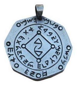
An amulet is a power object

Another example of a power object is an idol or a sacred stone. In tribal cultures and ancient pagan civilizations, it was common for people to have